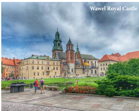
Wawel Royal Castle