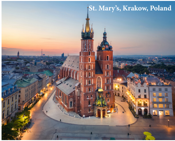
St. Mary's, Krakow, Poland